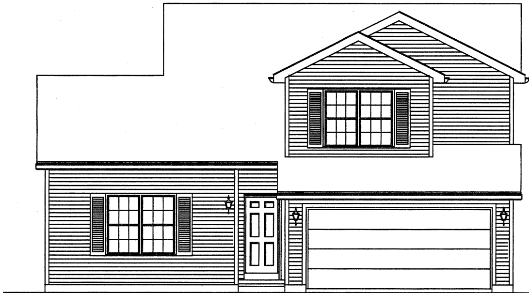
STANDARD FRONT ELEVATION