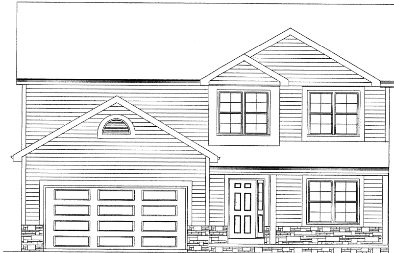
FRONT ELEVATION - OPTION A