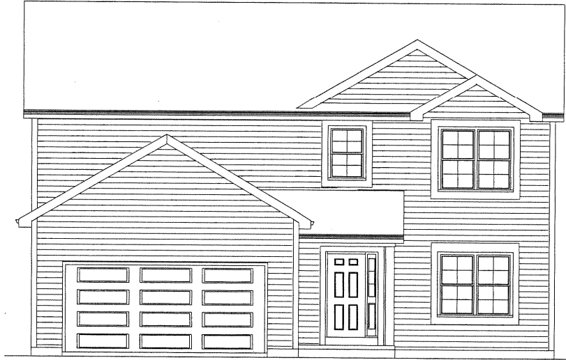
STANDARD FRONT ELEVATION