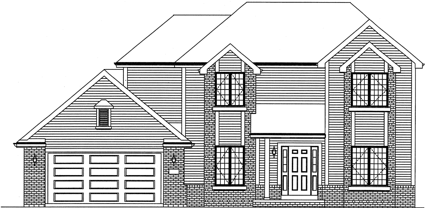
STANDARD FRONT ELEVATION