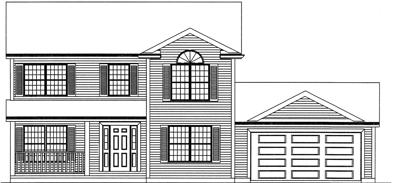
STANDARD FRONT ELEVATION