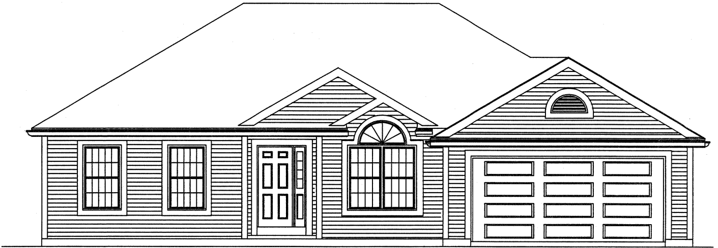
STANDARD FRONT ELEVATION