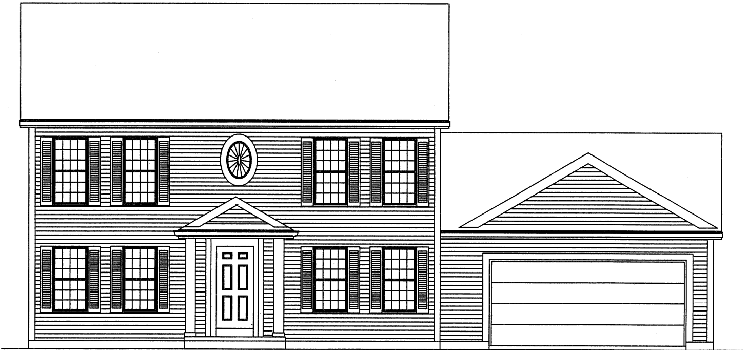
STANDARD FRONT ELEVATION