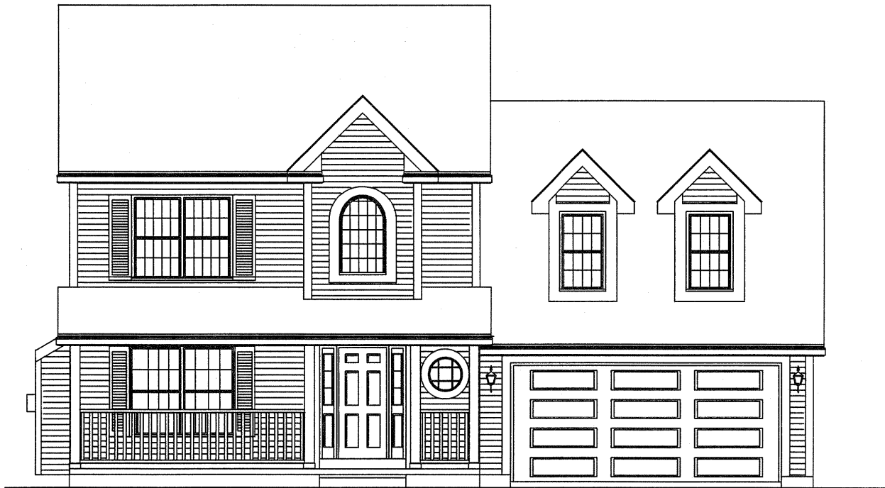
STANDARD FRONT ELEVATION