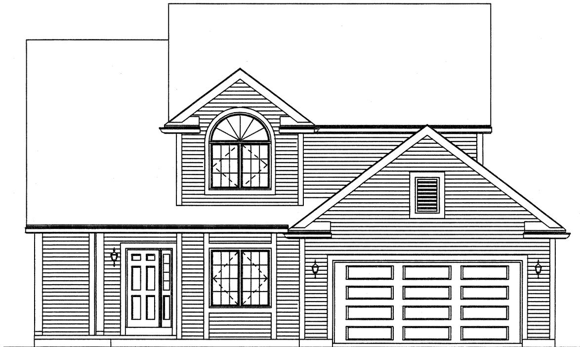
STANDARD FRONT ELEVATION