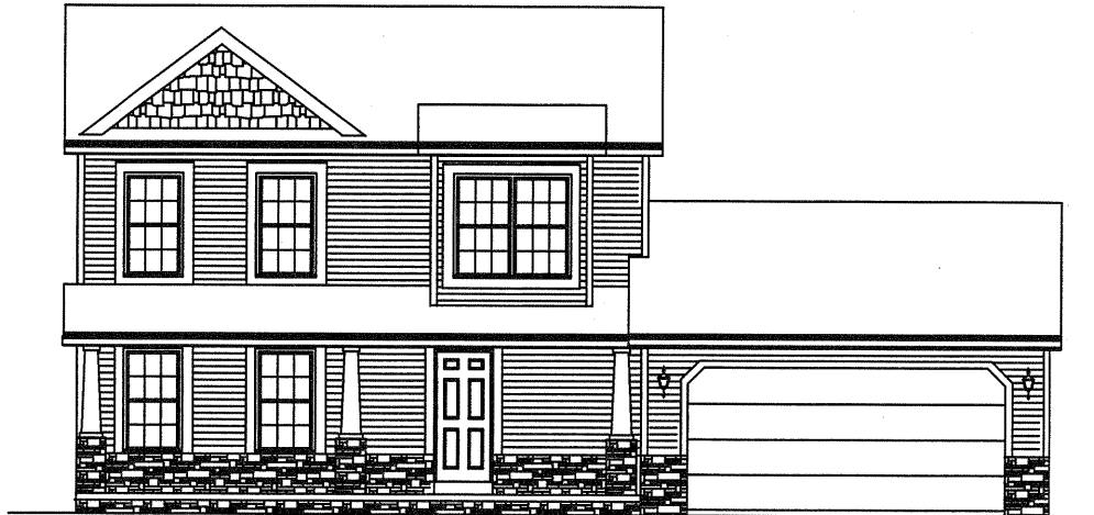
OPTIONAL ELEVATION A