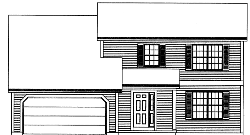
STANDARD FRONT ELEVATION