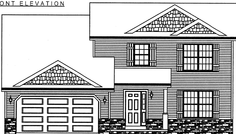
OPTIONAL ELEVATION A