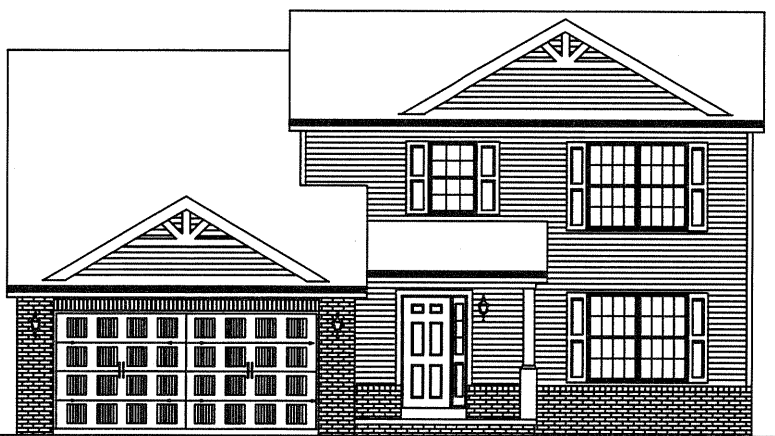
OPTIONAL ELEVATION B