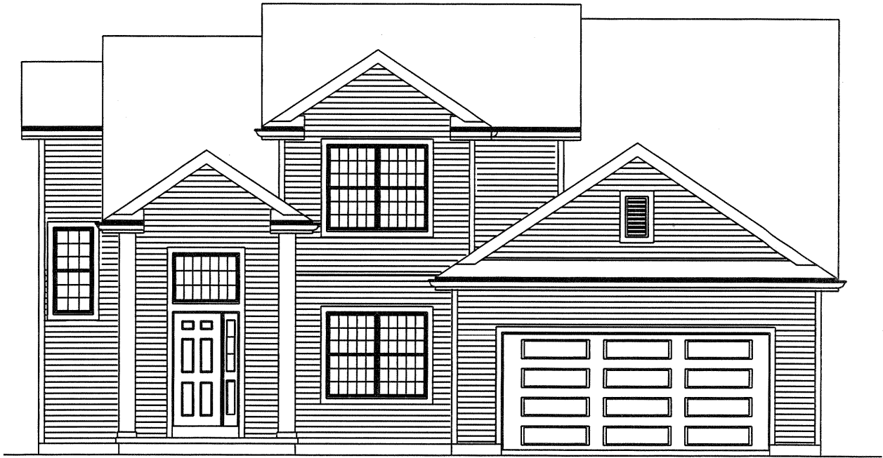
STANDARD FRONT ELEVATION