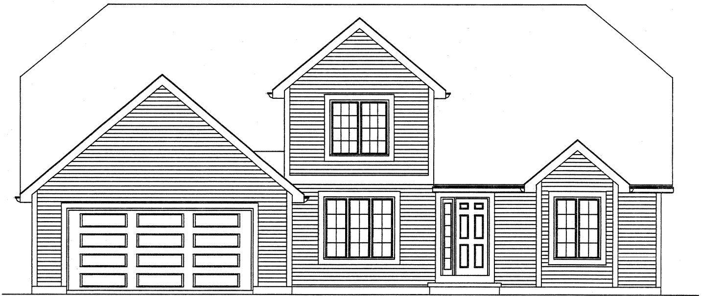
STANDARD FRONT ELEVATION