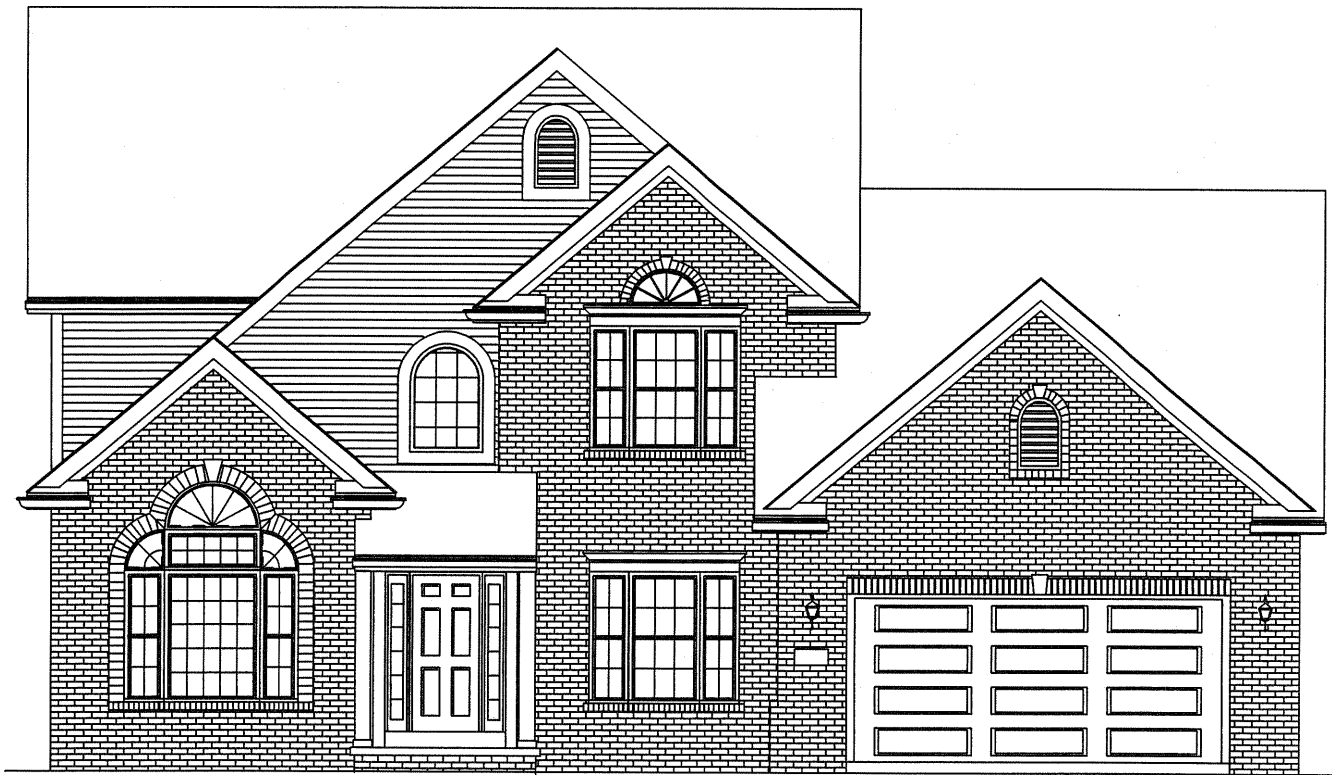
STANDARD FRONT ELEVATION