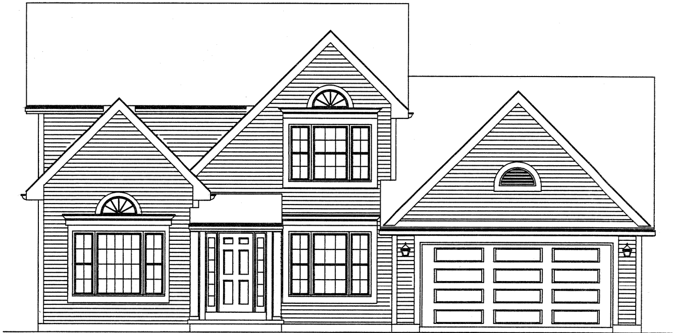
STANDARD FRONT ELEVATION