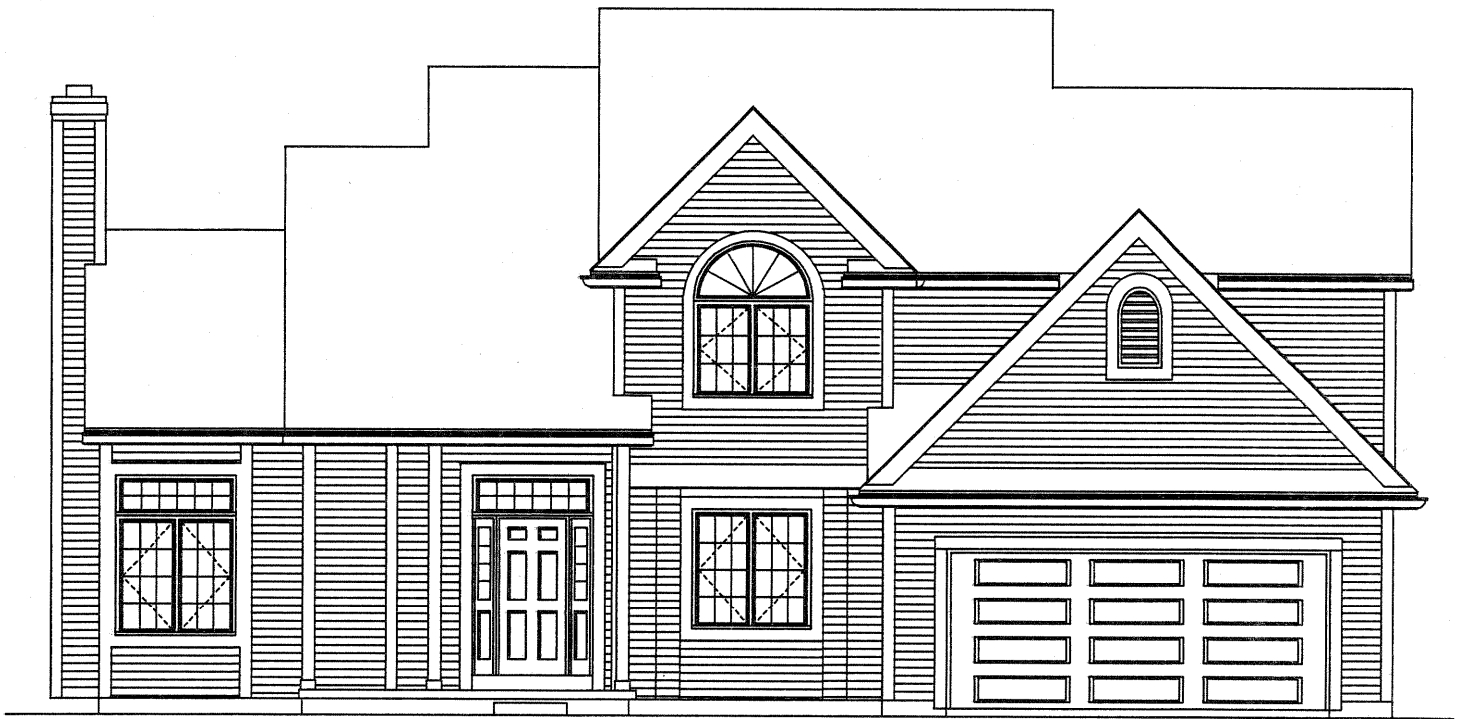
STANDARD FRONT ELEVATION