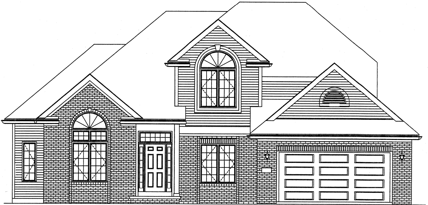
STANDARD FRONT ELEVATION