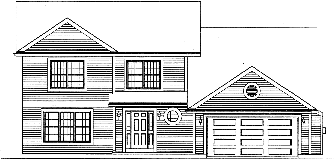
STANDARD FRONT ELEVATION