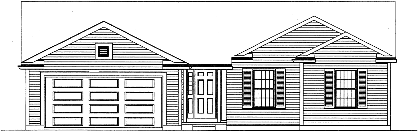
STANDARD FRONT ELEVATION